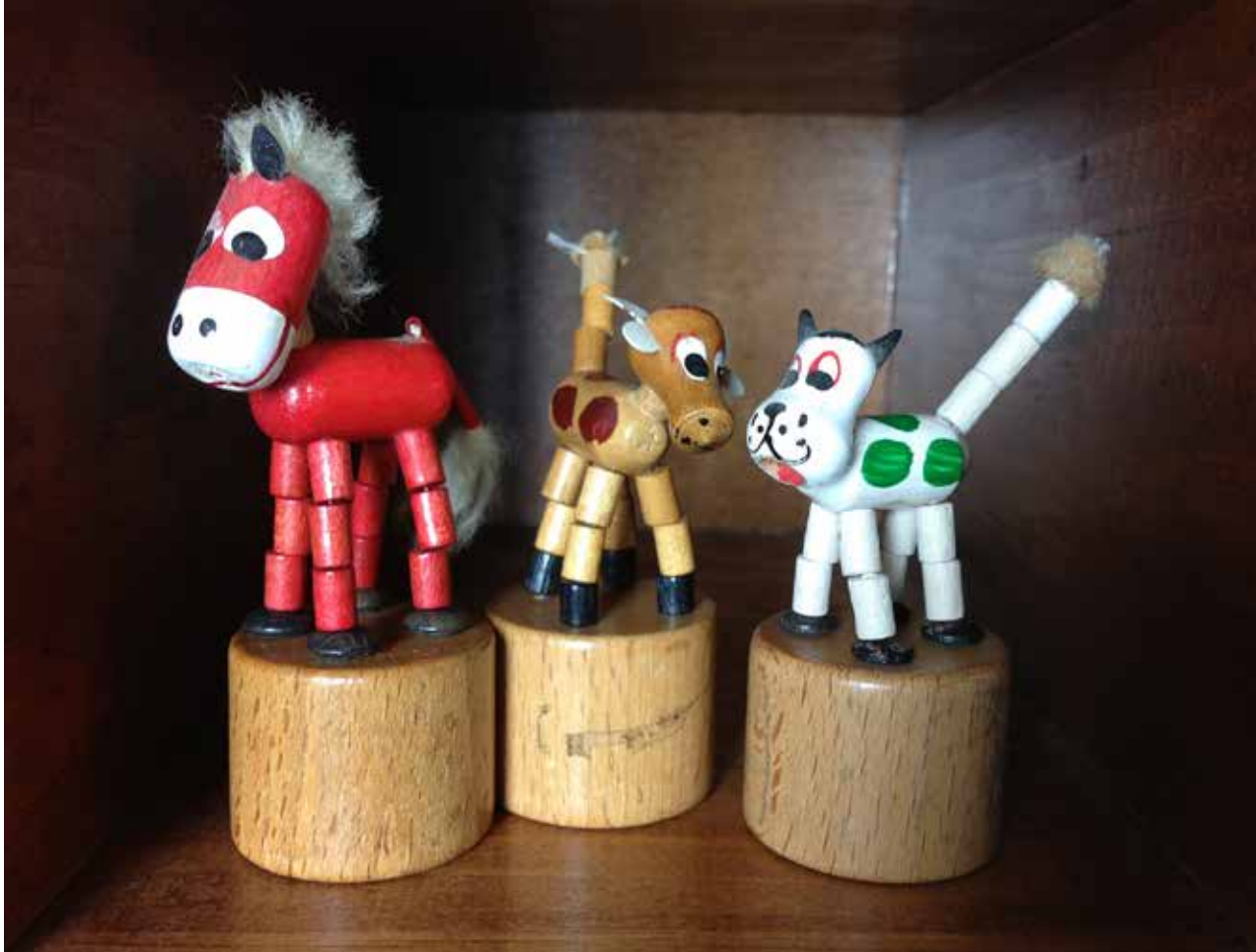
Push Puppets, wood, paint, string, 2 1/2" x 1" x 1.5" (from the collection of Melissa & Erick Mischke).